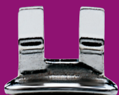
Traditional Miniature Bracket