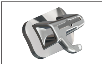
Victory Series™ Superior Fit Buccal Tubes

Victory Series™ Superior Fit Buccal Tubes offer excellent handling characteristics, optimized tube-to-tooth fit and a strong reliable bond. Combine with APC™ Flash-Free Adhesive for a complete system designed for optimal efficiency, control and versatility.